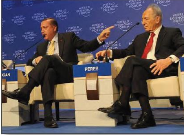
Görsel 5.8: T.C. Başbakanı Recep Tayyip Erdoğan'ın İsrail Cumhurbaşkanı Şimon Peres'e gösterdiği tepki

Moreover, instead of referring to Palestinians in terms of national identity, there is an emphasis on victimhood based on their Muslim identity. There appears to be an attempt to establish self-identification and an emotional connection between Turkish students and the Palestinian cause. To increase sympathy toward Palestinians, the Gaza Strip is described as the "biggest open air prison" in the world.