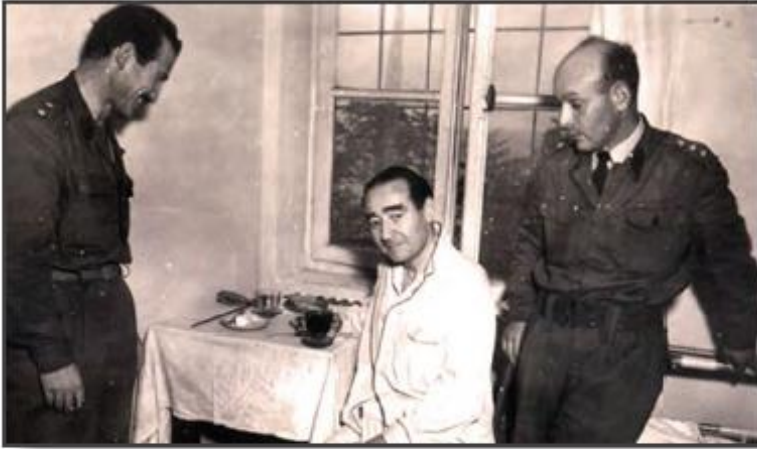
Görsel 3.42: Adnan Menderes Yassıada'da tutuklu

In the account of 1960's coup d'état , Adnan Menderes' Democrat Party (DP) is seen as the choice of the people while the opposition Republican People's Party (CHP) is painted as a natural collaborator with the coup's participants. The accomplices are described as members of an "exclusive privileged group" (ayrıcılık zümre), a term known to those familiar with Erdoğan's well-known references and accusations against the CHP and pro-coup army cliques.