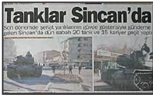
Görsel 5.34: Gazete manşeti

Along with the implication of continued American complicity in Turkey's troubles, the text points to numerous similarities between the 1960 coup and the failed attempt in 2016. Most interesting, however, is the exploitation of Atatürkism as an important catalyst for both of the events. Moreover, while the 1960 coup illustrates the struggle between the "center" [ merkez ] and the "periphery" [ çevre ] – references to the secular elite who lived in the urban city centers and those conservatives living in suburbs or rural areas, respectively - the 2016 failed coup is denigrated as "the act of the covert Fethullahist Terrorist Organization" (FETÖ). 60