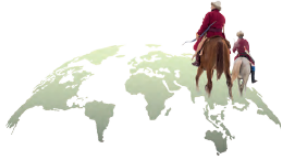
Görsel 1.6: Türk Cihan Hâkimiyeti (Temsil)

Türk tarihinde Hunlardan itibaren bir cihan imparatorluğu olma arzusu ve dünyaya düzen verme ülküsünün olduğu görülür. Türk hakanları; "Güneş bayrağımız, gökyüzü kadrimiz." diyerek bu ülküyü ifade etmişlerdir.