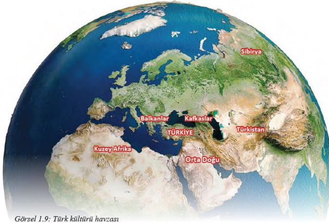
Görsel 1.9: Türk kültürü havzası