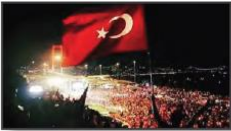
Görsel 5.41: Demokrasi nöbetleri