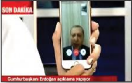
Görsel 5.40: Cumhurbaşkanı Recep Tayyip Erdoğan'ın halkı darbeye karşı sokağa çağırması