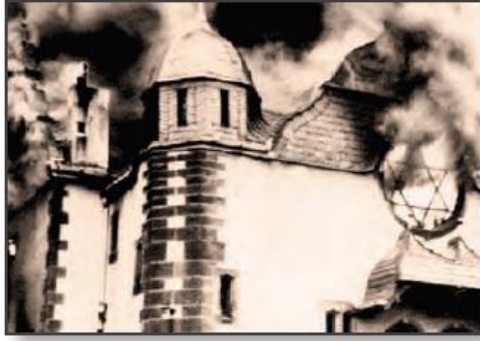
Görsel 2.12: Kristal Gece'de yakılan bir sinagog

"Image 2.12: A synagogue that was set to fire during 'Kristallnacht'"