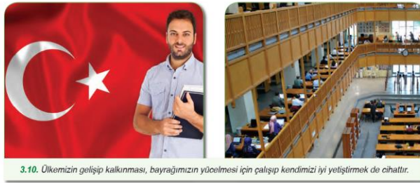
Image 3.10. Improving oneself and working for the progress of our country

With respect to this call to missionize, the curriculum teaches students that the struggle that is jihad requires the Muslim believer to remove all obstacles to Islam's active practice. Seen from another perspective, jihad means to fight with life and property when necessary, and to protect and preserve religion, homeland, flag and national and spiritual values. 41 To support this idea, the text references the Qur'an's Al-Furqan verse (25:52): "So do not yield to the infidels, but strive diligently against them with this Qur'an."