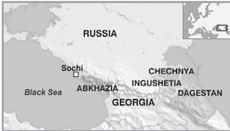
Map 1. Sochi in its geographical context.