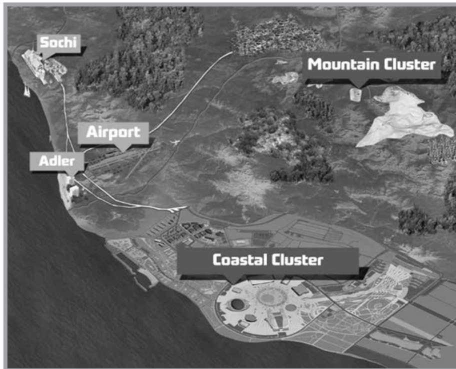
Map 2. Location of 'Sochi 2014' Olympic 'clusters'.