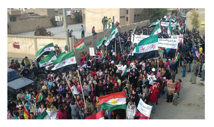
Kurdish anti-Assad protest march

Currently, the Syrian Kurdish opposition is divided into three groupings, all of which were originally formed in October 2011: those in the Syrian Kurdish National Council supported by Iraqi Kurdistan, those in the Syrian National Council supported by Turkey, the GCC, and the West, and those in the National Coordination