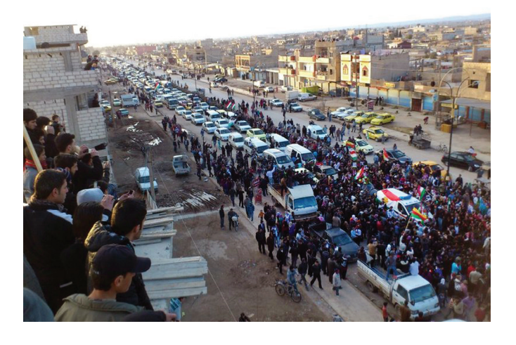
Anti-regime protesters wave Kurdish flags during a rally in Qamishli, a town in north-east Syria.

member of the SNC. The KNC also includes over a dozen Kurdish Local Coordination Committees (LCCs) and Kurdish youth groups on the ground in Syria<sup>18</sup>.