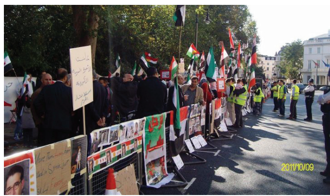
In Qamishli and surrounding Kurdish areas there are weekly protests in solidarity with besieged city of Homs and others demanding fall of regime, release of prisoners and the support for KNC.